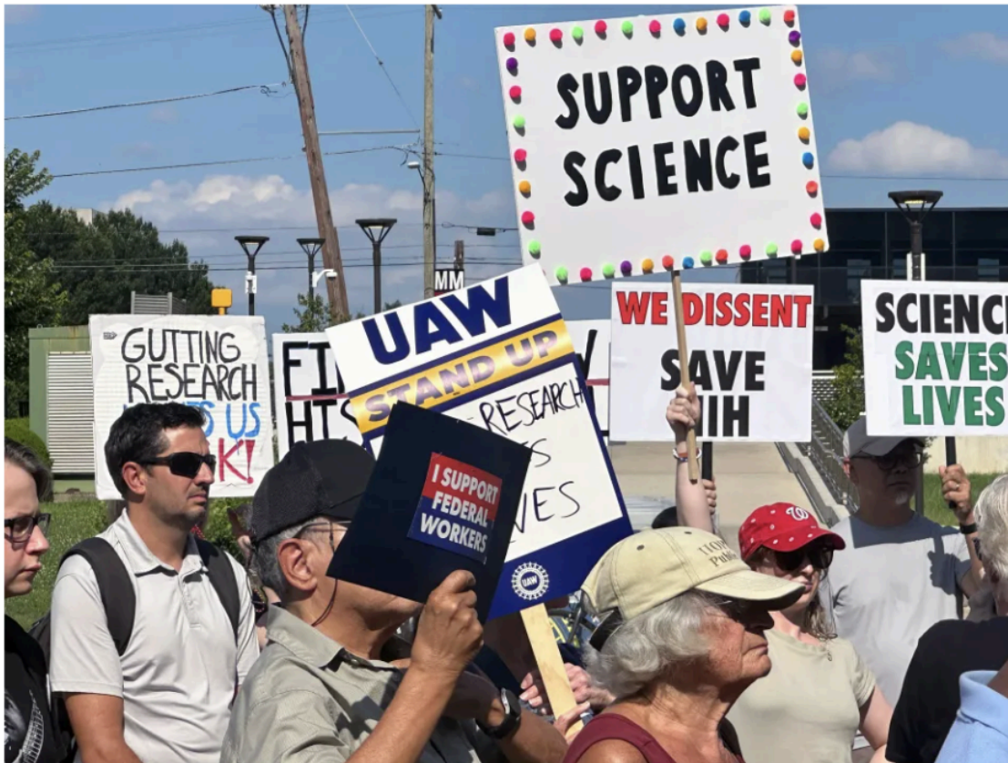
Laid off National Institutes of Health employees and supporters rally on July 21 against cuts to the federal workforce.